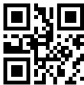
Cancel the previous read a string of data