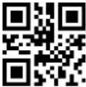
Setup code on

Note: the entire list of current zone bit is saved to Flash while the configuration is modified through the setup code, that is, the configuration that is configured through the serial port but not saved will also be saved together.