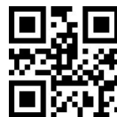
Forbid reading EAN13