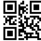
*Code93 min length at 4

Scan following code to change max length of code93